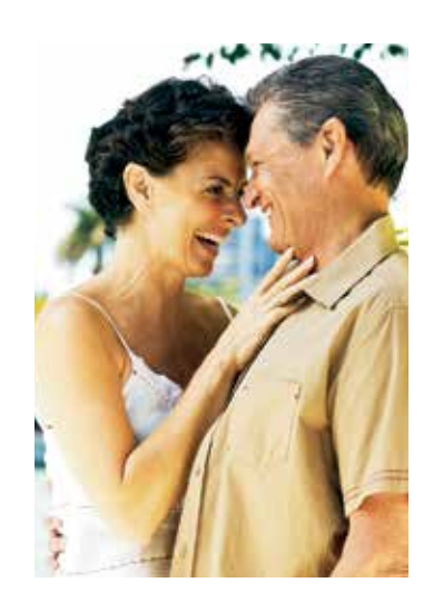
Holding and touching each other, as well as enjoying time together are also important parts of loving and being loved.

It is also important to realize that being sexual means more than just having sexual intercourse. Holding and touching each other, as well as enjoying time together are also important parts of loving and being loved.