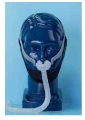
Nasal pillow mask