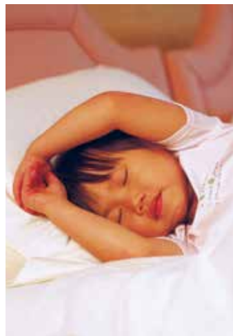
The bedroom is the most important room to make skin friendly.

Emotions and stress do not cause atopic dermatitis, but they may bring on itching and scratching. Anger, frustration and embarrassment can cause flushing and itching. Day to day stresses as well as major stressful events can lead to or worsen the itch-scratch cycle.