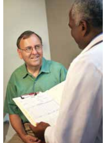
Talk with your doctor about an exercise program.

The following pages will give you more information about each component.