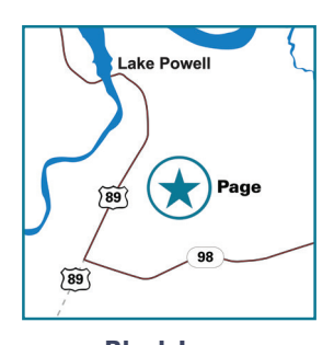
Black Lung Page, Arizona