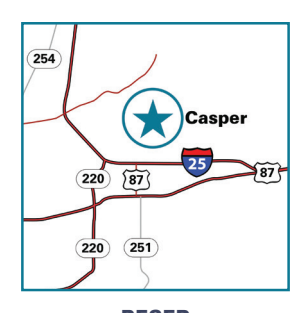
RESEP Casper, Wyoming