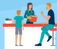
Keep Routines & Schedules