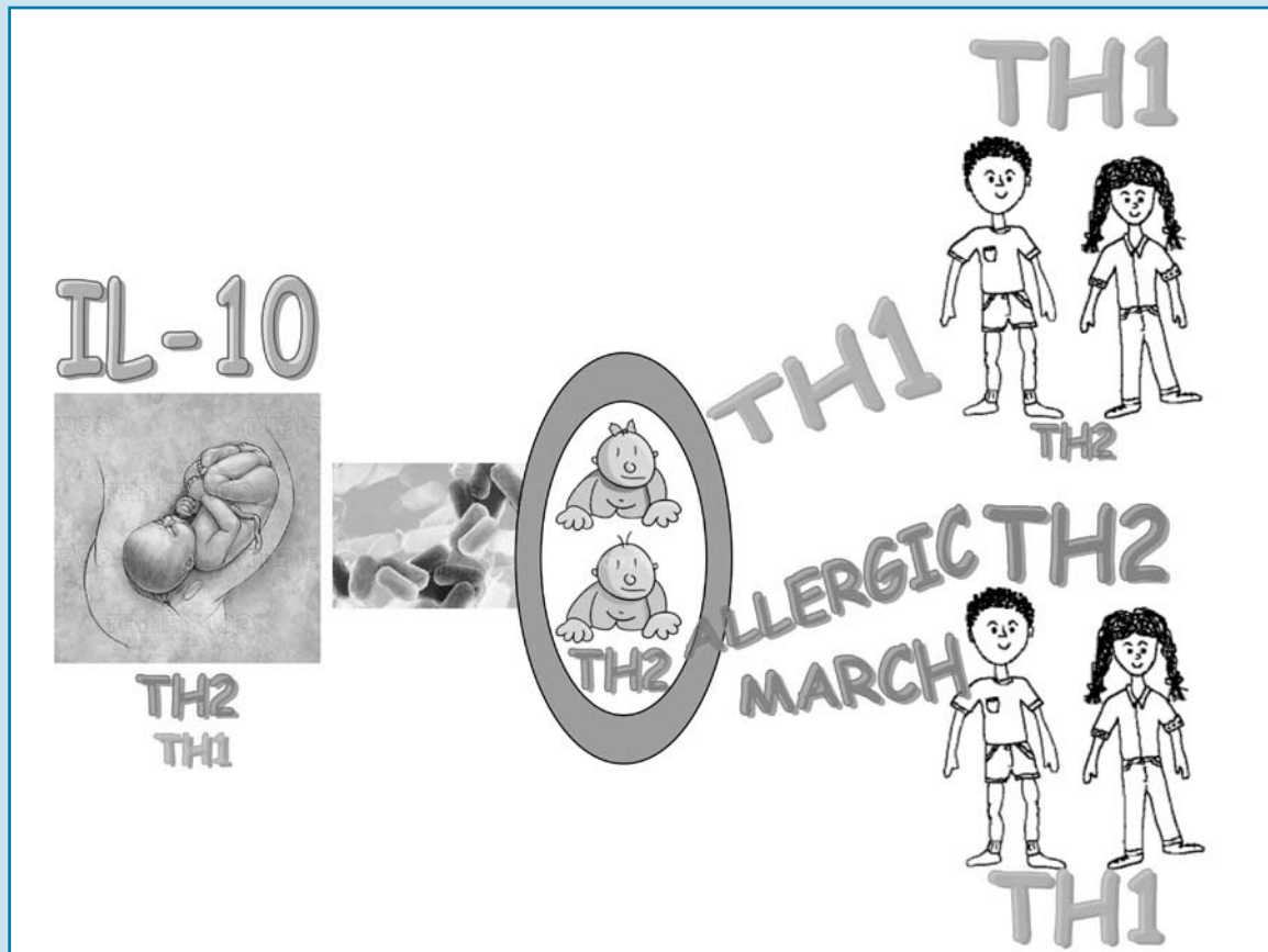
Figure 3 The hygiene theory.

Protective Th1 immune responses to microbial exposures begin immediately after birth. Th1-based immune development prevents pro-allergic Th2 immune development and atopy.