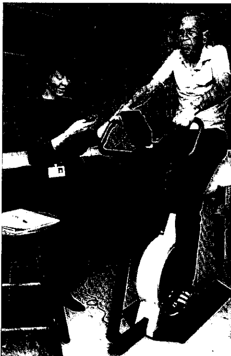
During a maximal exercise test, the therapist monitors the patient's heart function, oxygen saturation and oxygen consumption.

An initial evaluation of the patient is conducted with three goals in mind. First, the