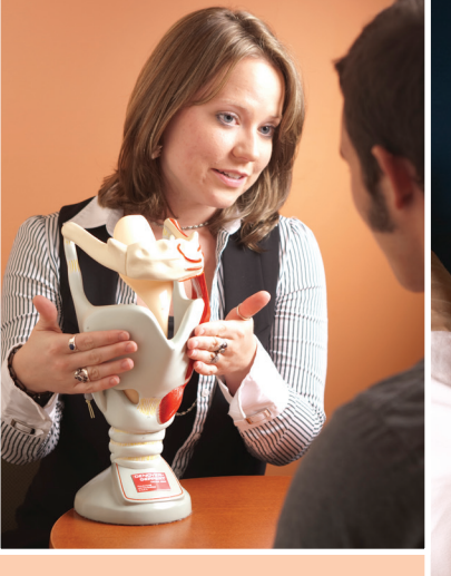
Patient education regarding anatomy.